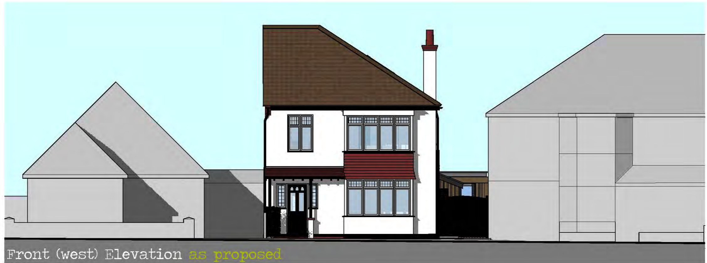
Front (west) Elevation as proposed